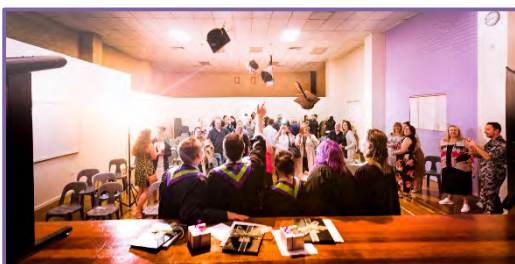
Novo Education Space

Each campus has a range of teaching, learning support and wellbeing staff to meet student education and wellbeing needs